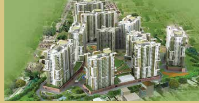
GREENAGE Hosur Main Road, Bengaluru