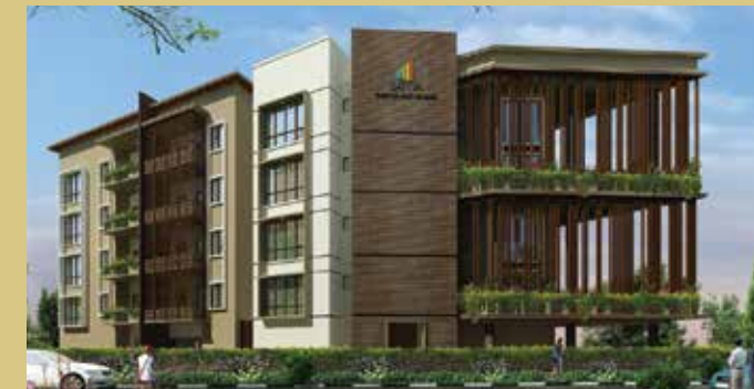
CASA CRESCENT Benson Town, Bengaluru