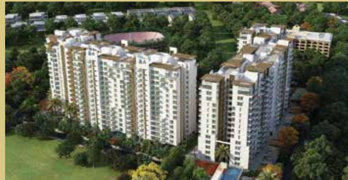
NAVARATNA RESIDENCY Avinashi Road, Coimbatore