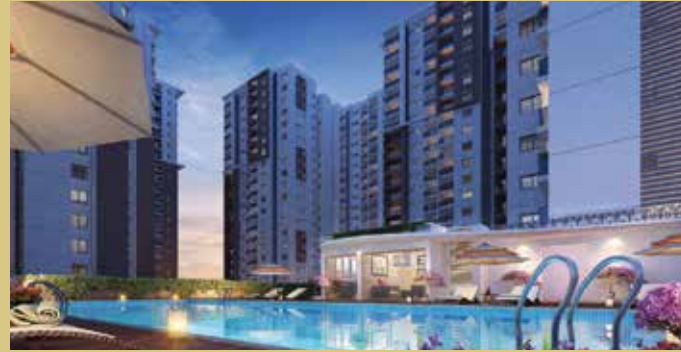
DIVINITY Mysore Road, Bengaluru