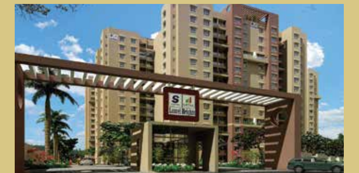
LAUREL HEIGHTS Hesarhatta Main Road, Bengaluru