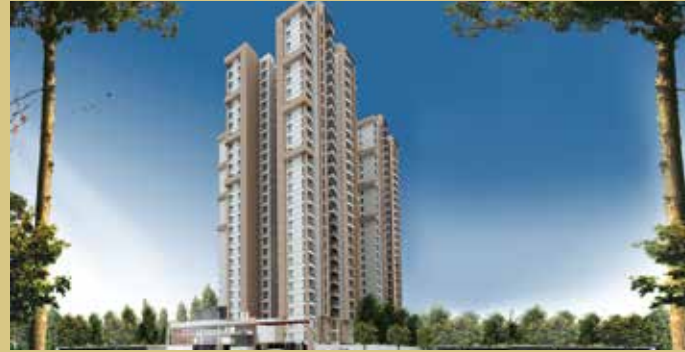
CASA IRENE Bannerghatta Road, Bengaluru