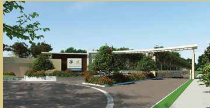
PIPAL TREE Magadi Main Road, Bengaluru