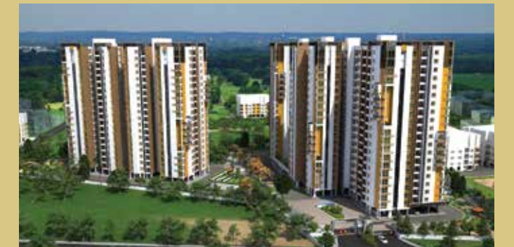
SEJORITA Sarjapura Main Road, Bengaluru