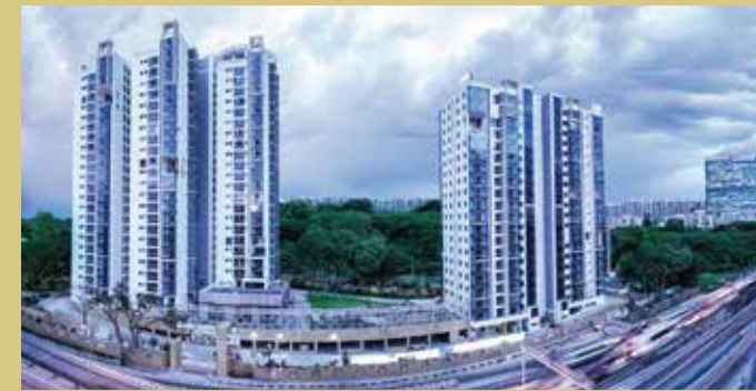
LUXURIA 8th Main Malleshwaram, Bengaluru