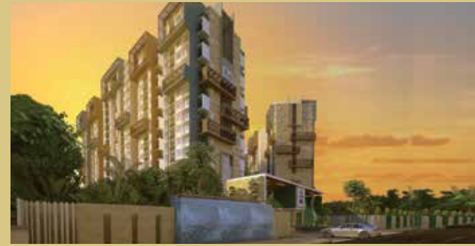
EAST CREST Budigere Cross, OMR, Bengaluru