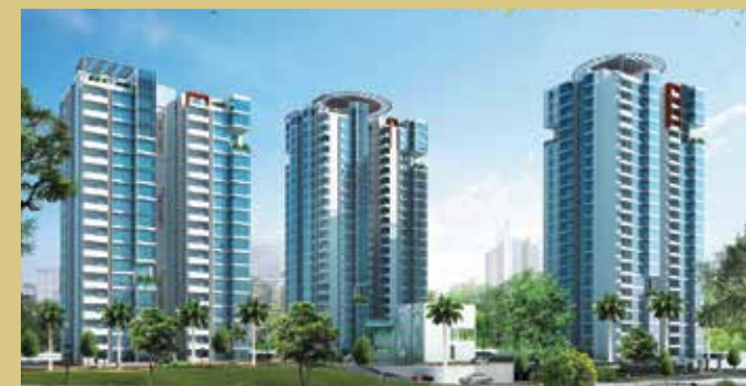
MAGNIFICIA Old Madras Road, Bengaluru