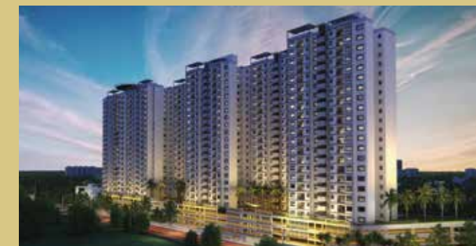
CADENZA Hosur Main Road, Bengaluru